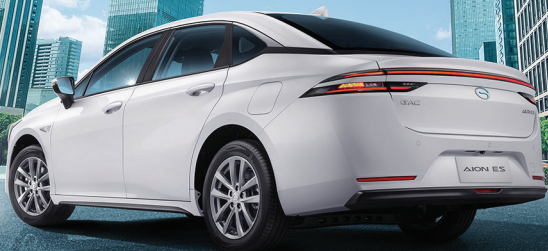
Sleek Exterior Design